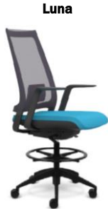
Luna 3466-3468 Mid-Back Task Stool